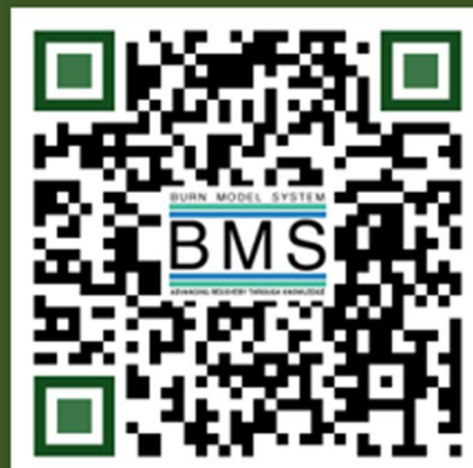
Spanish Burn Resources