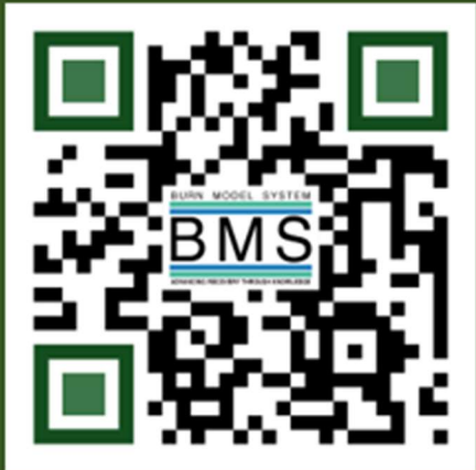
English Burn Resources